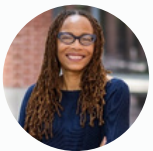
Dorothy E. Roberts, JD University of Pennsylvania